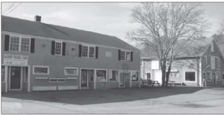
The three buildings in the Millbrook area on St. George Street are slated for a facelift.